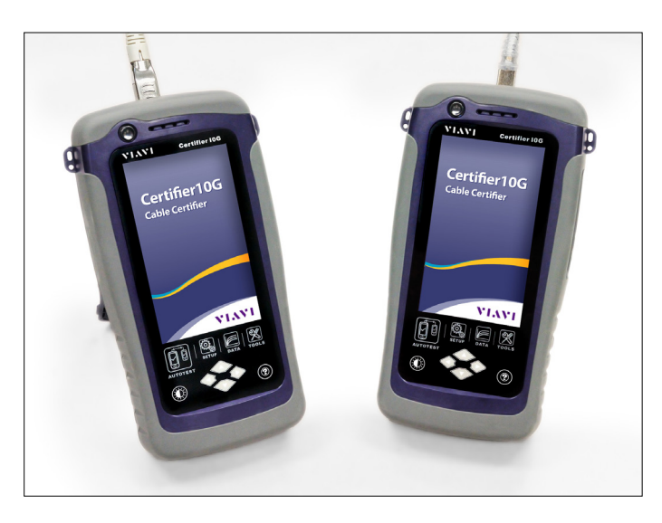
Two complete units minimize time initiating, naming, and saving results